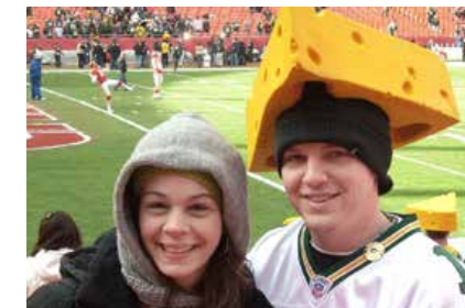
GO PACKERS GO!