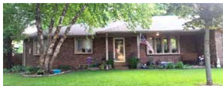
WELCOME TO OUR HOME!

Our families always get together for holidays like Thanksgiving and Christmas. We bounce around and try to spend equal time with both sides. Both sets of grandparents are so excited to welcome a child into the family and can't wait to spoil another grandchild.