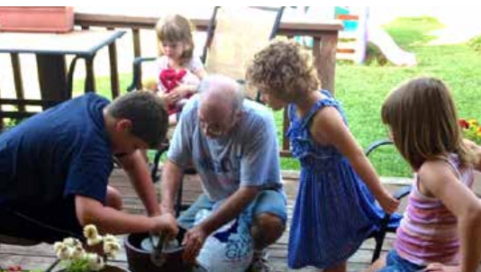
MAKING ICE CREAM WITH GRANDPA