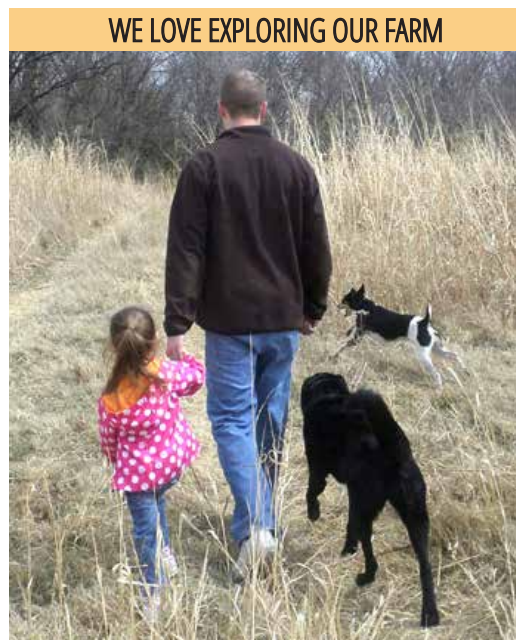
WE LOVE EXPLORING OUR FARM