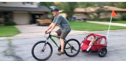
ON A BIKE RIDE WITH PAPA