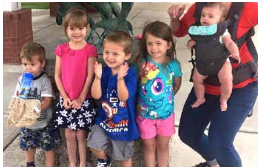
FAMILY FUN AT THE AQUARIUM