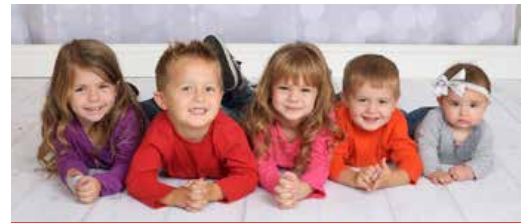
COUSINS ARE ALWAYS FUN!