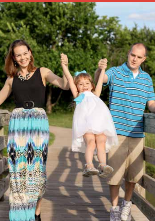
OUR FAMILY LOVES TO PLAY!