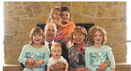
COUSINS WITH GRANDMA AND GRANDPA