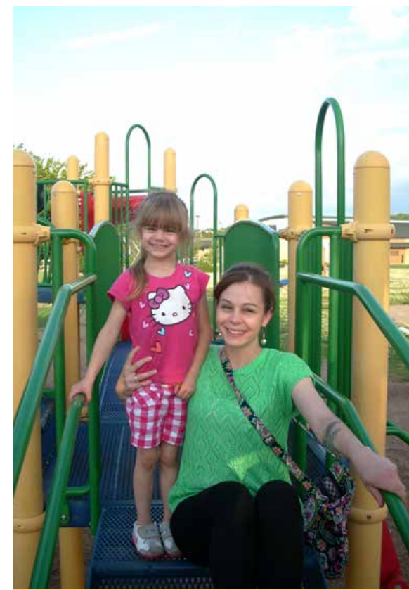
WE LOVE GOING TO THE PARK