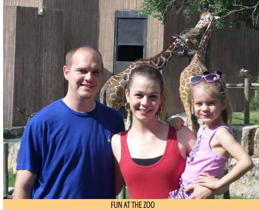
FUN AT THE ZOO