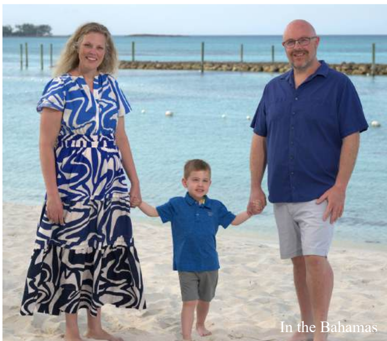
In the Bahamas