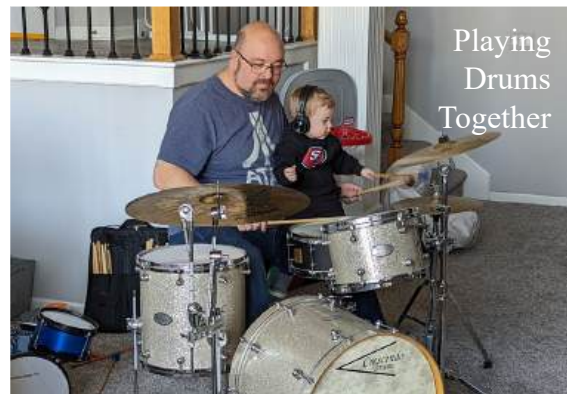
Playing Drums Together