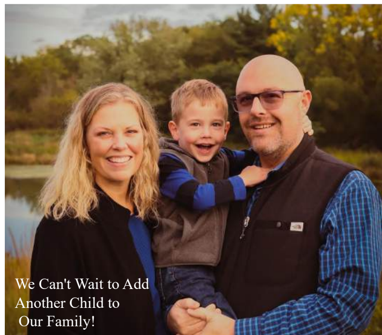
We Can't Wait to Add Another Child to Our Family!